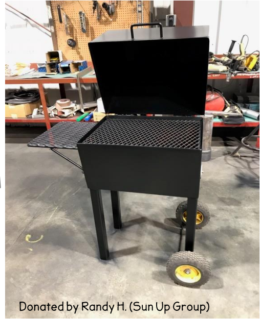
Donated by Randy H. (Sun Up Group)

Tickets are $5.00* each and available at Central Office You can also purchase them by phone using your credit or debit card and calling 337-991-0830